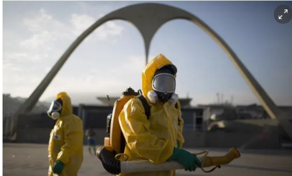
▲ The World Health Organization said the fact that the 2016 Games will take place during Brazil's winter lowers the risk of being bitten by mosquitoes.